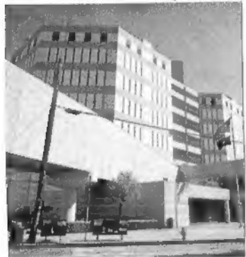
Twin Towers correctional facility, Los Angeles